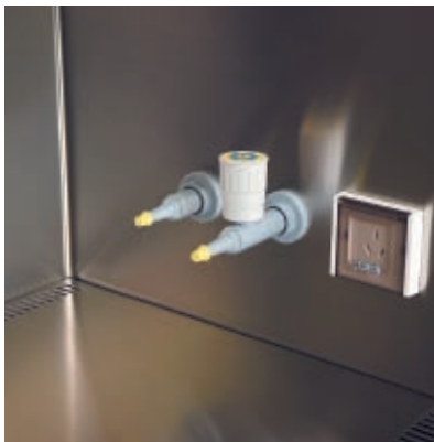
BH-EN work zone