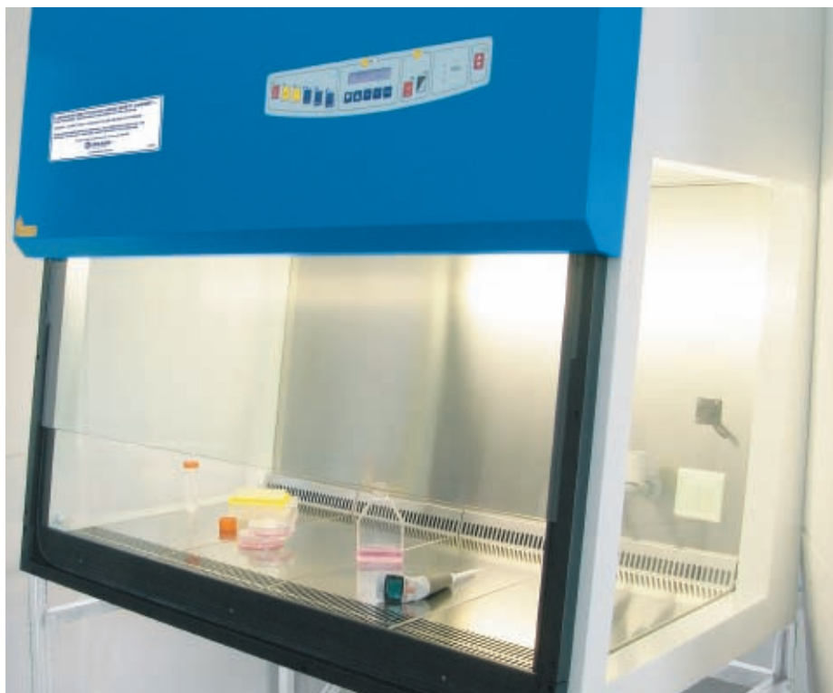
UltraSafe 212D electric sash window cabinet

Gelaire safety cabinets are tested and certified on-site, prior to use by an independent NATA-registered testing laboratory.