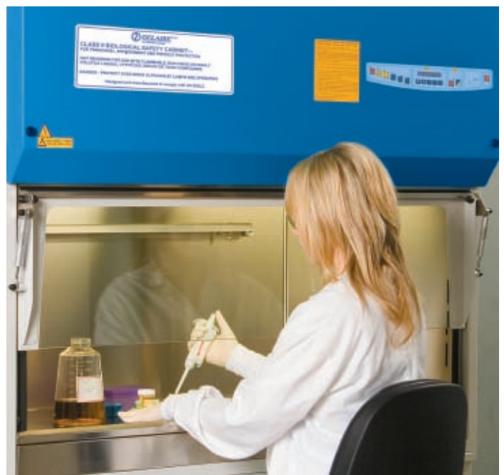
BH-EN2004 hinged window cabinet

ECS® control and energy management the new ECS® (Eco Control System) microprocessor employs the latest technology for integrated management of airflows and filtration. Self-regulation of airflows compensates for gradual loading of filters, while restoring power balance. Combining AC fans and certified low pressure-drop filters, the ECS® system optimises power consumption, thereby reducing CO 2 emissions into the environment.